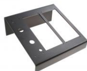
TRIPLE DESK STAND