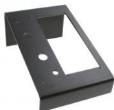
DUAL DESK STAND