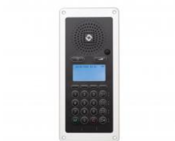
1008431000 CRM-V-2 IP Flush Master Station