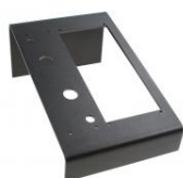
DUAL DESK STAND