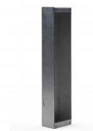
FLUSH MOUNT BACK BOX